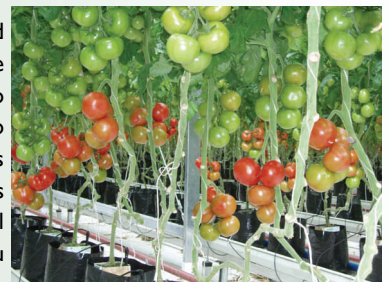
Truss Tomatoes: Sweeter and juicer, a taste sensation

ing summerfruit and capsicum seasons. We also have a new tomato supplier on board who believes that he grows the best truss tomatoes you will ever taste. Feel free to contact us if you are interested!