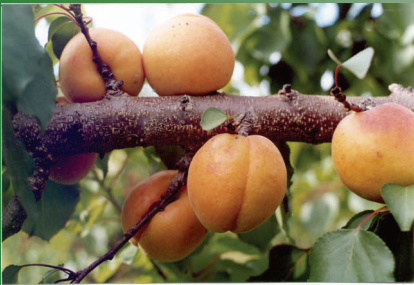
Nevis Apricots on the tree

The Nevis series of apricots has great potential due to the late timing of some of the varieties, which can be as late as April. The